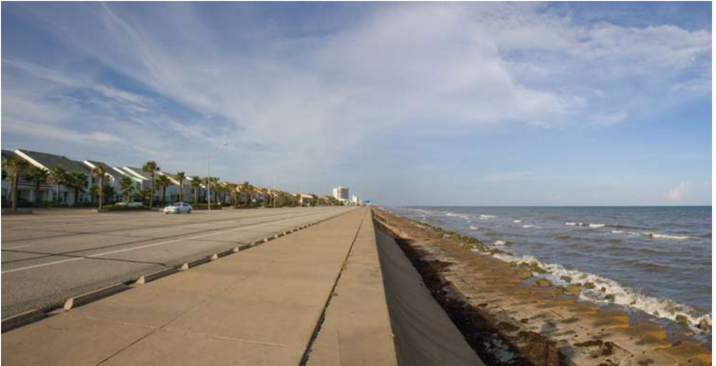
CONDOS LINE SEAWALL BOULEVARD in Galveston, literally a stone's throw from the Gulf. While people may give other reasons for moving to the coast — climate and casual lifestyle, for example — living on the water is what it's really all about.

Welcome to life on the Texas coast, a region that is finally catching the nation's attention after years of going virtually unnoticed, and a region that more than a few developers are now referring to as "the last frontier" in beach development.